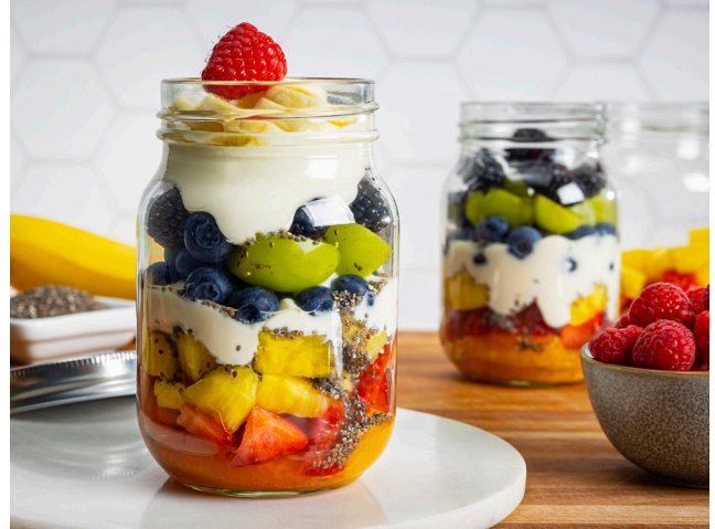
Ultimate Fruit Infinity Jars