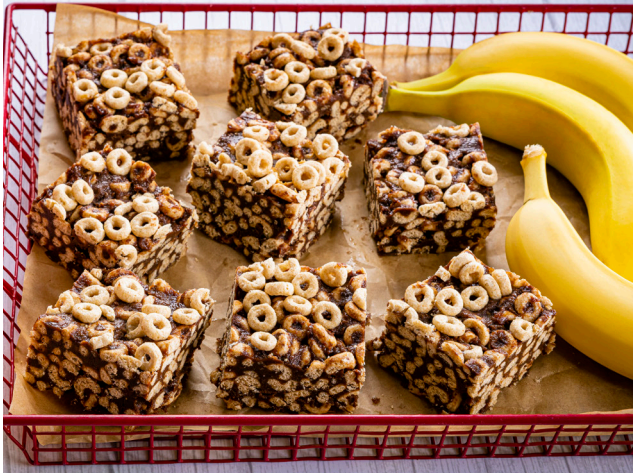
Grab & Go Chewy Banana Cereal Bars

Back to School is the time for creativity and broadening horizons. Explore all the kid- and family- friendly healthy and delicious recipes at Dole.com or just scan the QR codes below!