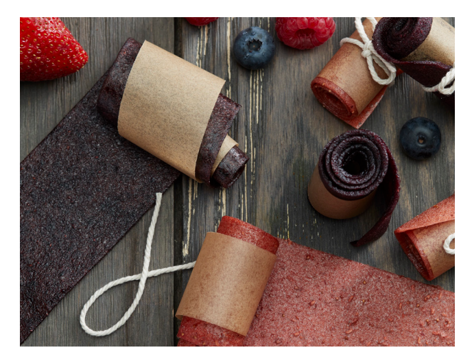
Oven-Dried Fruit Leather

Back to School is the time for creativity and broadening horizons. Explore all the kid- and family- friendly healthy and delicious recipes at Dole.com or just scan the QR codes below!